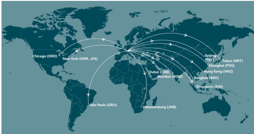
Swiss WorldCargo Intercontinental Flight Network

The team, despite the fundamental change in their focus, quickly adapted and helped to stabilize the demand for new business. Of course, they can be proud of their work, because in addition to supporting the fight against Coronavirus here in Switzerland, these charter flights are also helping to keep Switzerland connected to the global markets. Our customers, both old and new ones, meanwhile confirm our quality promise in this segment.